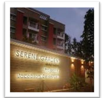
Serene Gardens at night`