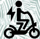
Electric charging point - 2W