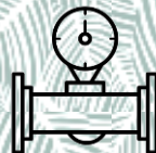
GAIL Gas Pipeline