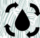
STP & Water Softener plant

Luxury living, thoughtful amenities: Water, Gym, gardens, serenity.