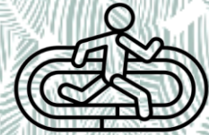
Jogging / Walking Track