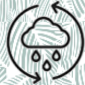
Rainwater Harvesting & Collection