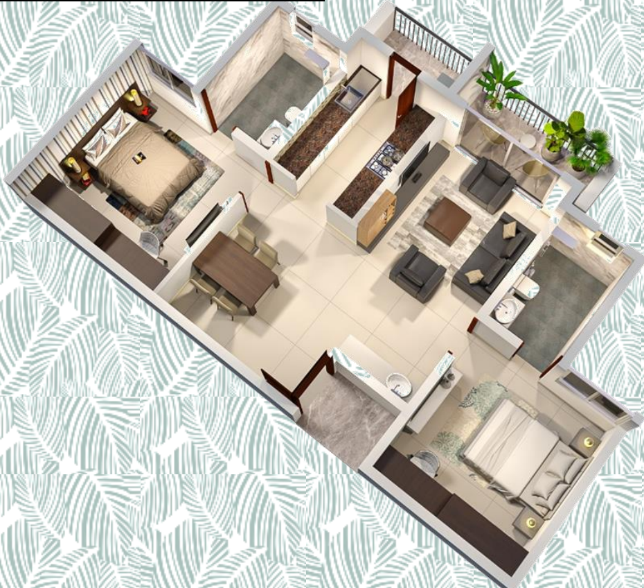
2 BHK UNIT TYPE 02 SUPER BUILT-UP AREA: 1197 SFT CARPET AREA: 922 SFT