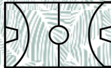
Multi sport arena