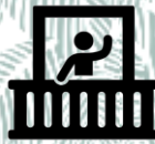
Viewing Pavilion for Elders