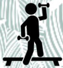
Fitness Center / Gym